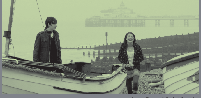
Angus, Thongs & Perfect Snogging